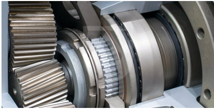
Thrust washer for electric cars