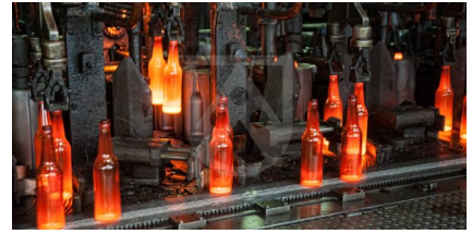
Gripper for glass bottles